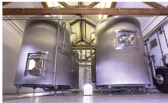
Inside the brewery: the hop back and the copper