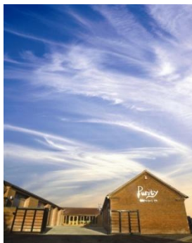
Outside the brewery